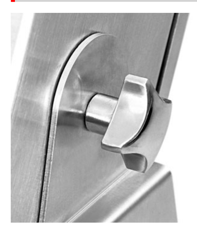
STAINLESS steel inclination adjustment system