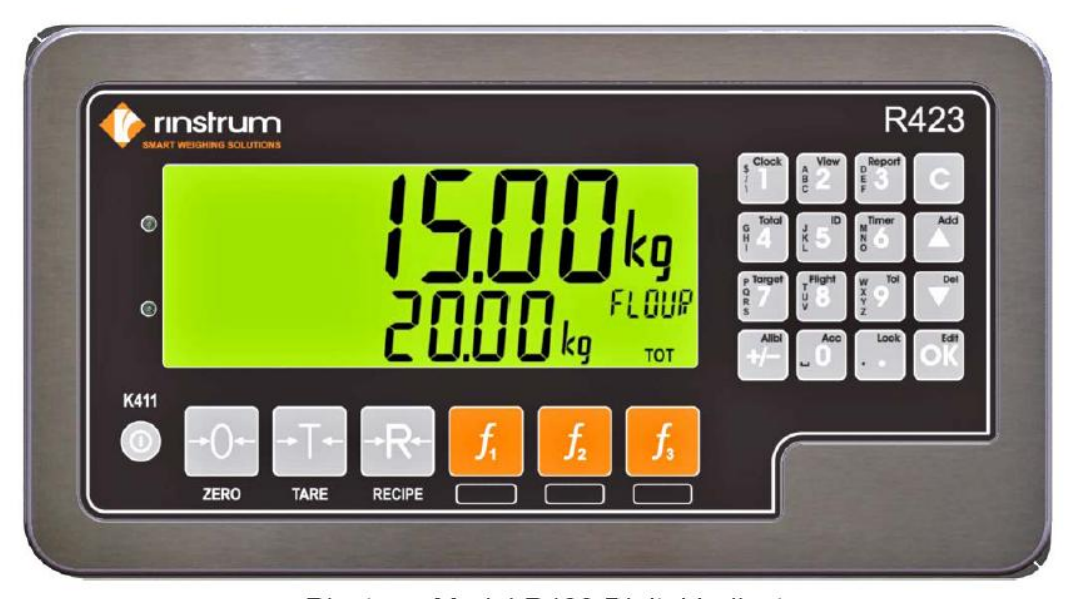
Rinstrum Model R423 Digital Indicator