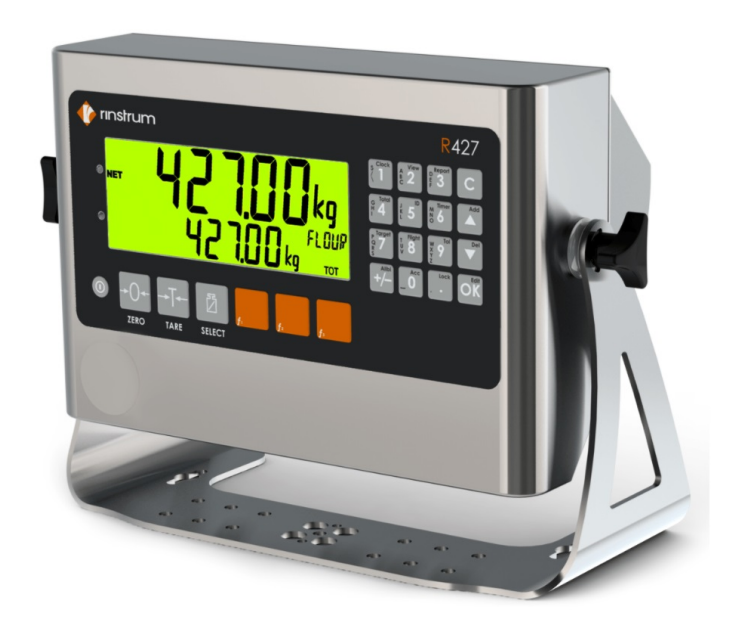
Figure 1 (Variant 4) - Rinstrum Model R427 Digital Indicator

Mark of Verification: As detailed in Certificate 1813