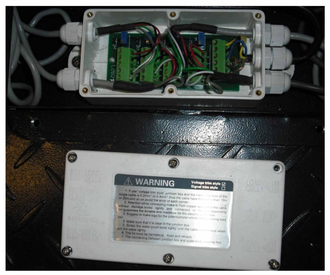
Figure 2 - Junction Box

Serial number . . . . . . . . Pattern approval number ..... Maximum capacity Emax ..... Class ...... • Four Zemic type HC8-C3-1.5T-4B load cell Components: • A Rinstrum model R320 digital indicator (or any approved compatible indicator may be used) · As provided on the approved indicator Sealing: • The Junction box shall be sealed by an adhesive destructible label or an approved type seal placed across the joining of both the covers, as shown at locations in the photo. Mark of Verification: An adhesive destructible label or an approved type seal that inhibits access to calibration on the indicator and the junction box should carry a Mark of Verification. Removal of seal deems the instrument not verified. Levelling: Four adjustable feet and a level indicator is provided. Adjacent to level indicator a level notice stating "incorrect if not truly level" or a similar wording must be shown.